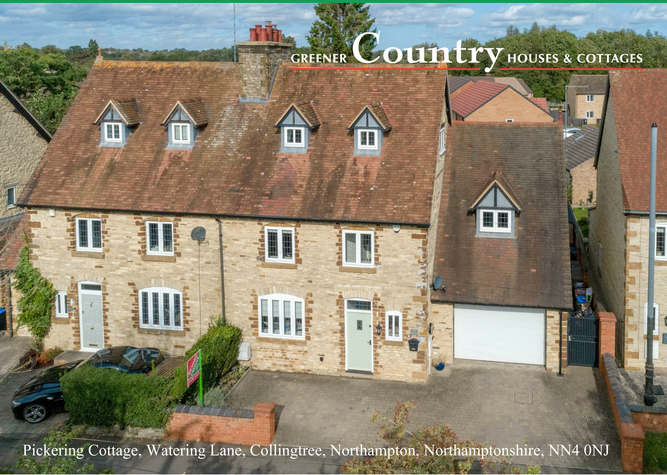
Pickering Cottage, Watering Lane, Collingtree, Northampton, Northamptonshire, NN4 0NJ